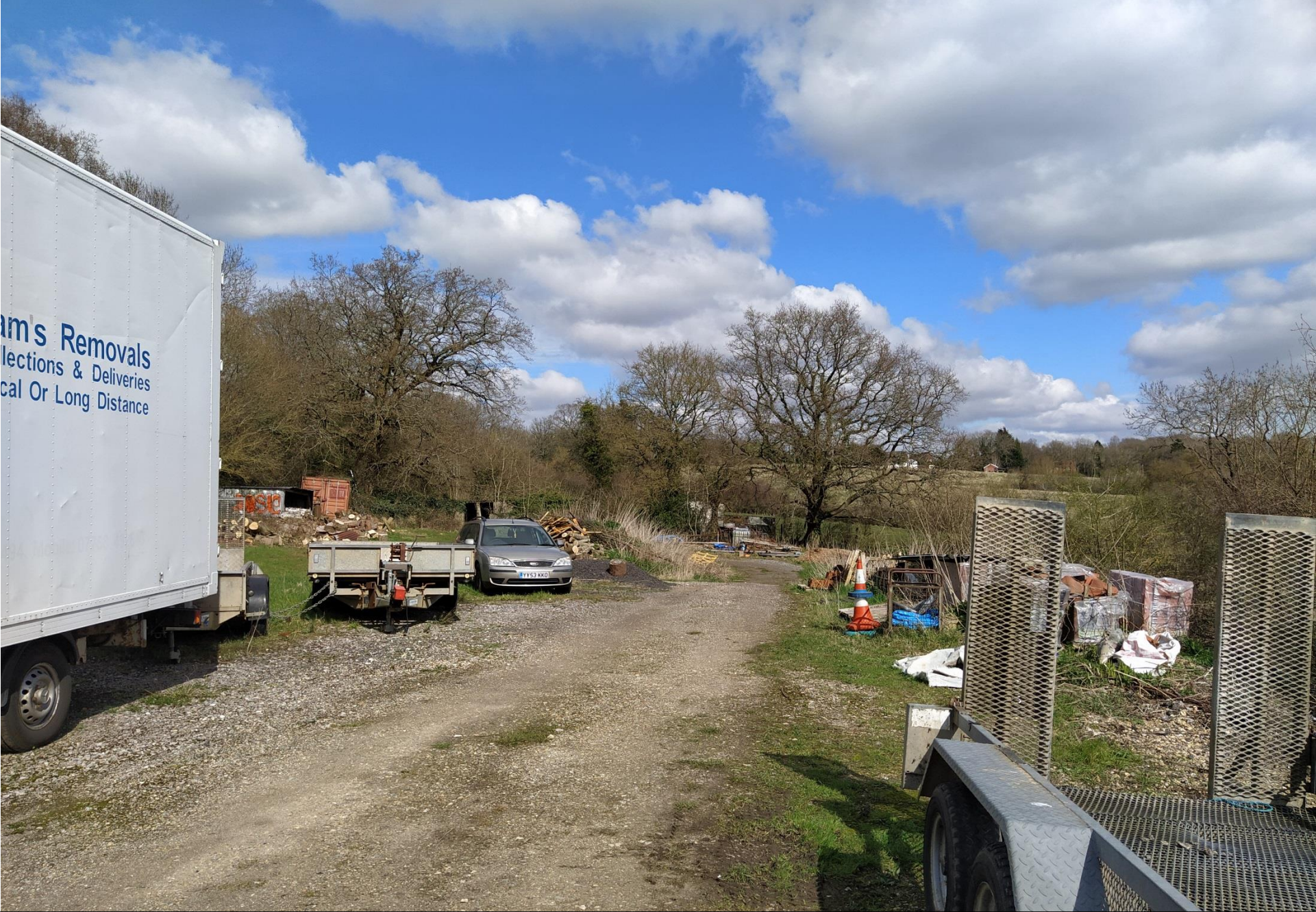
Storage of cars and debris within the site (to the west)