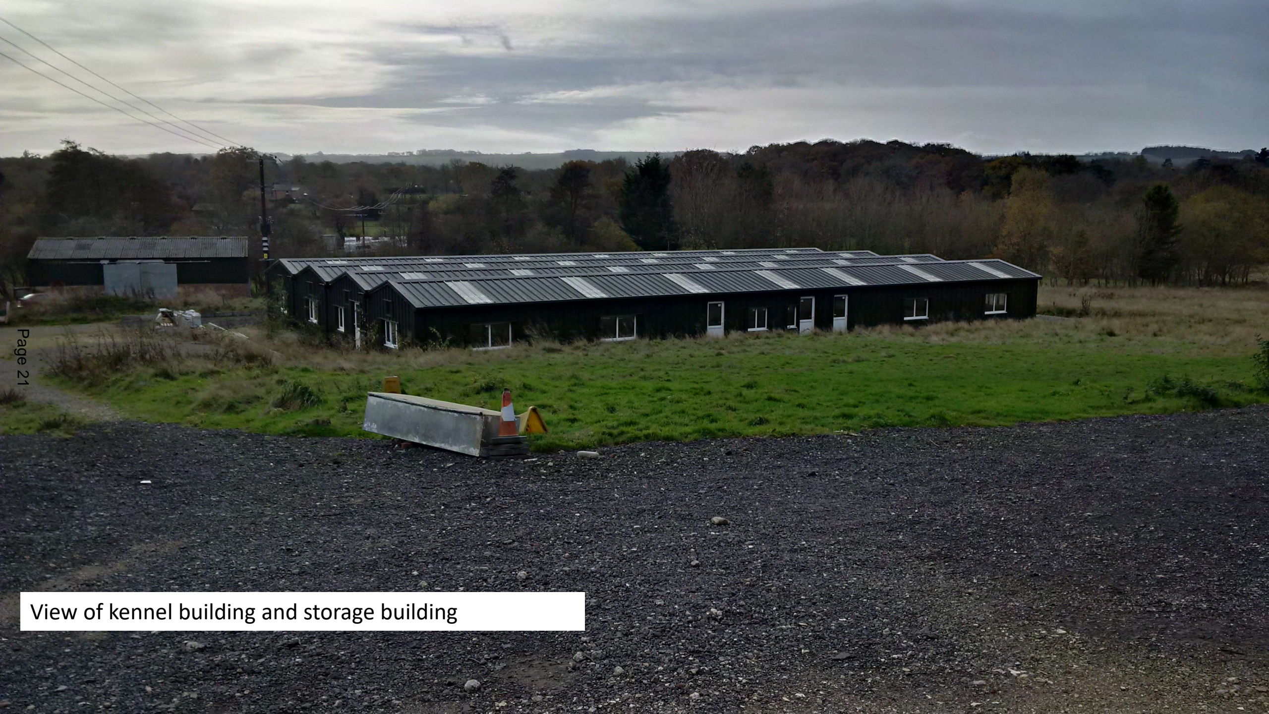
View of kennel building and storage building