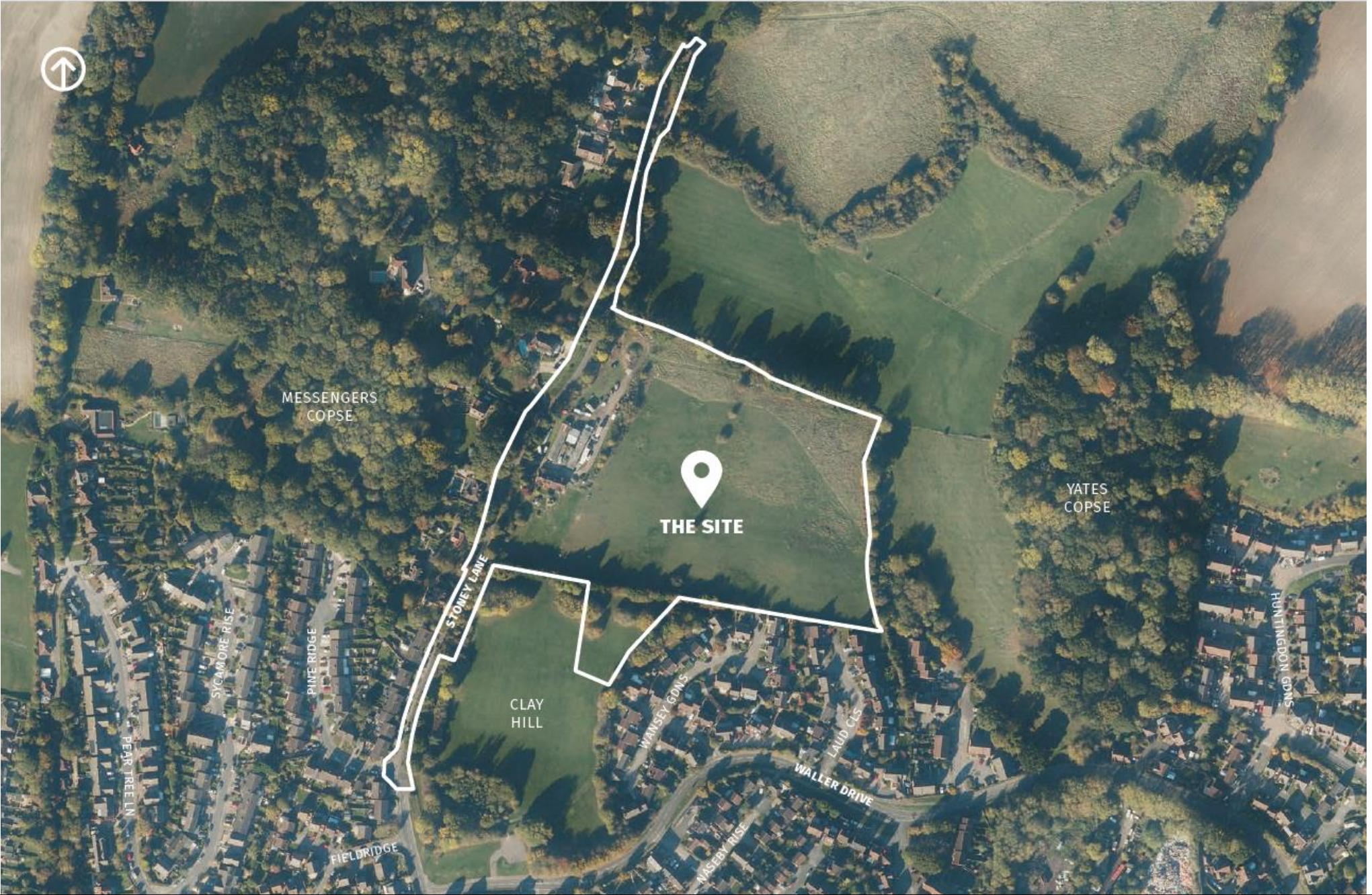
Ariel view of the site and surround area