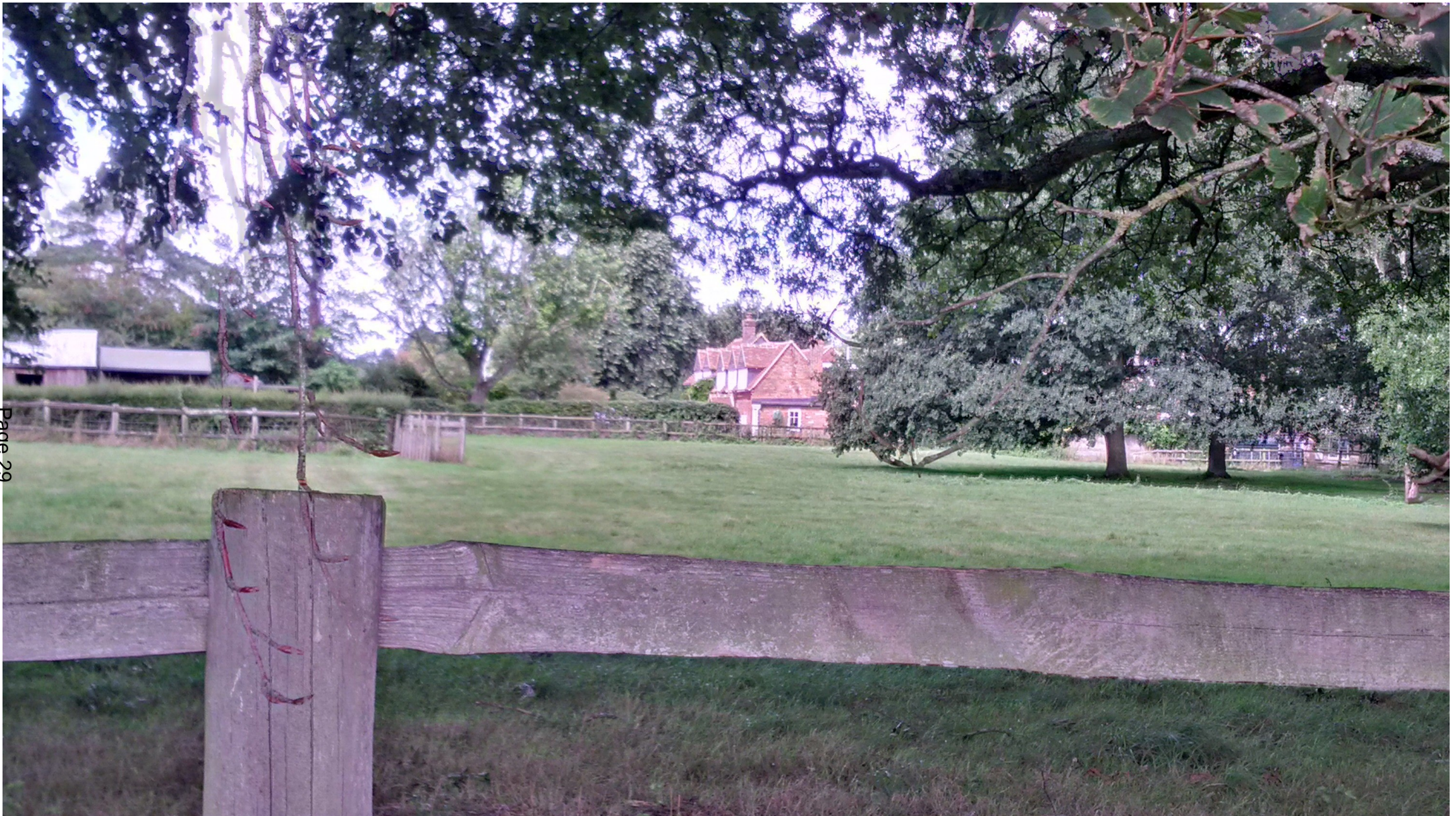
Location of riding arena and stables looking towards Bee Cottage