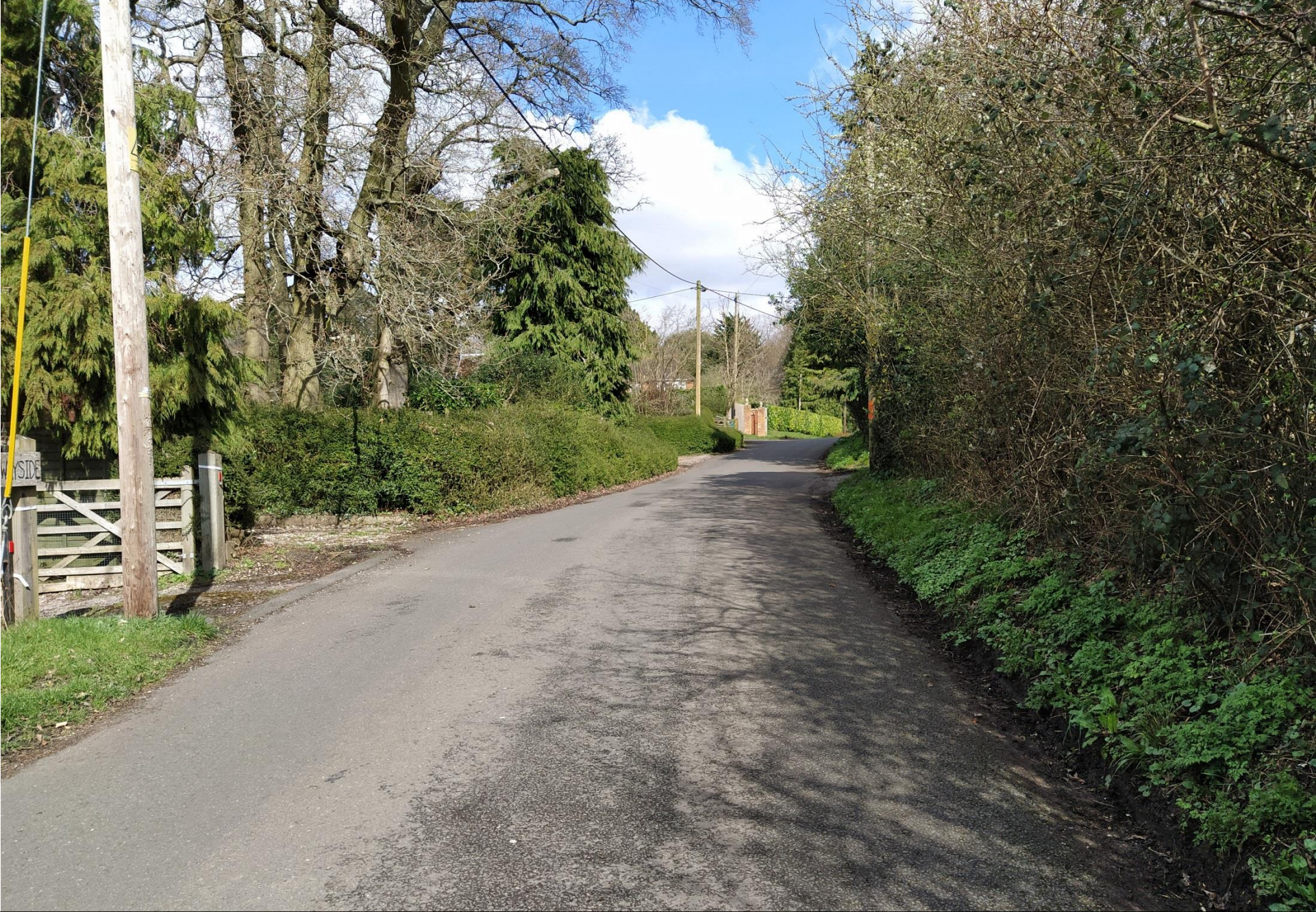
Stoney Lane (looking north)