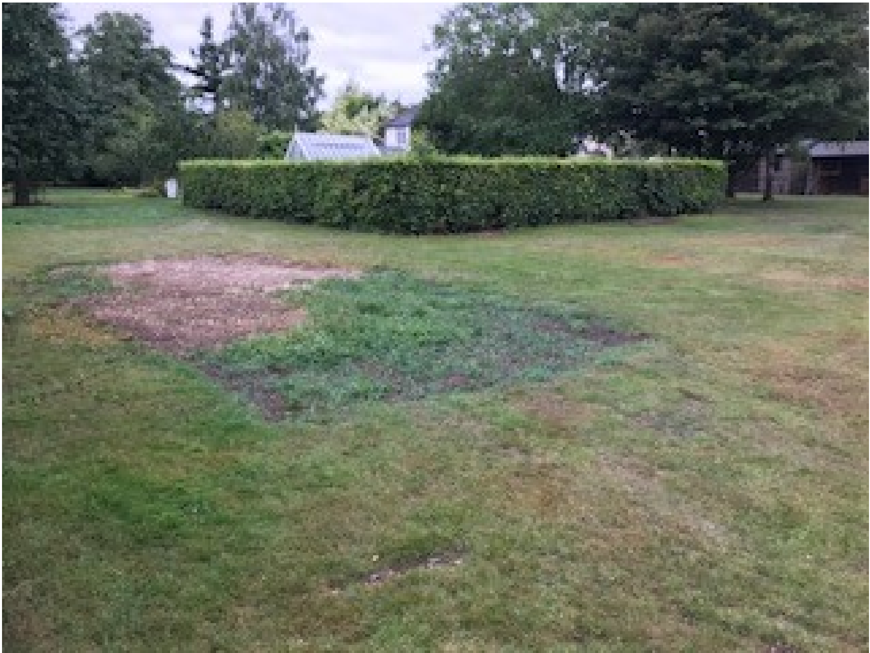
Location of stable building viewed within the site