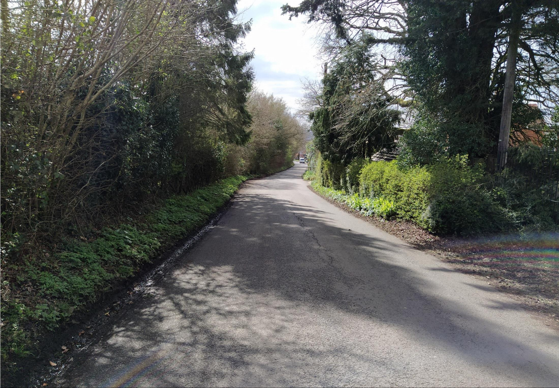
Stoney Lane (looking south)