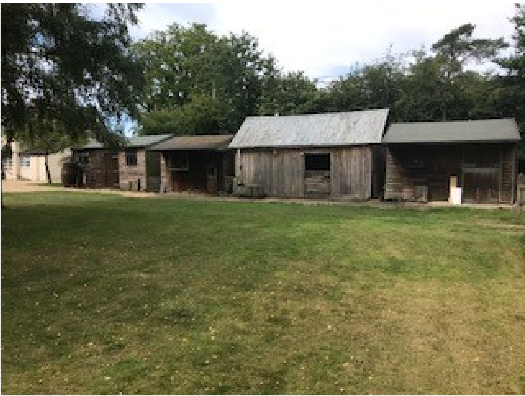
View of outbuildings to be demolished