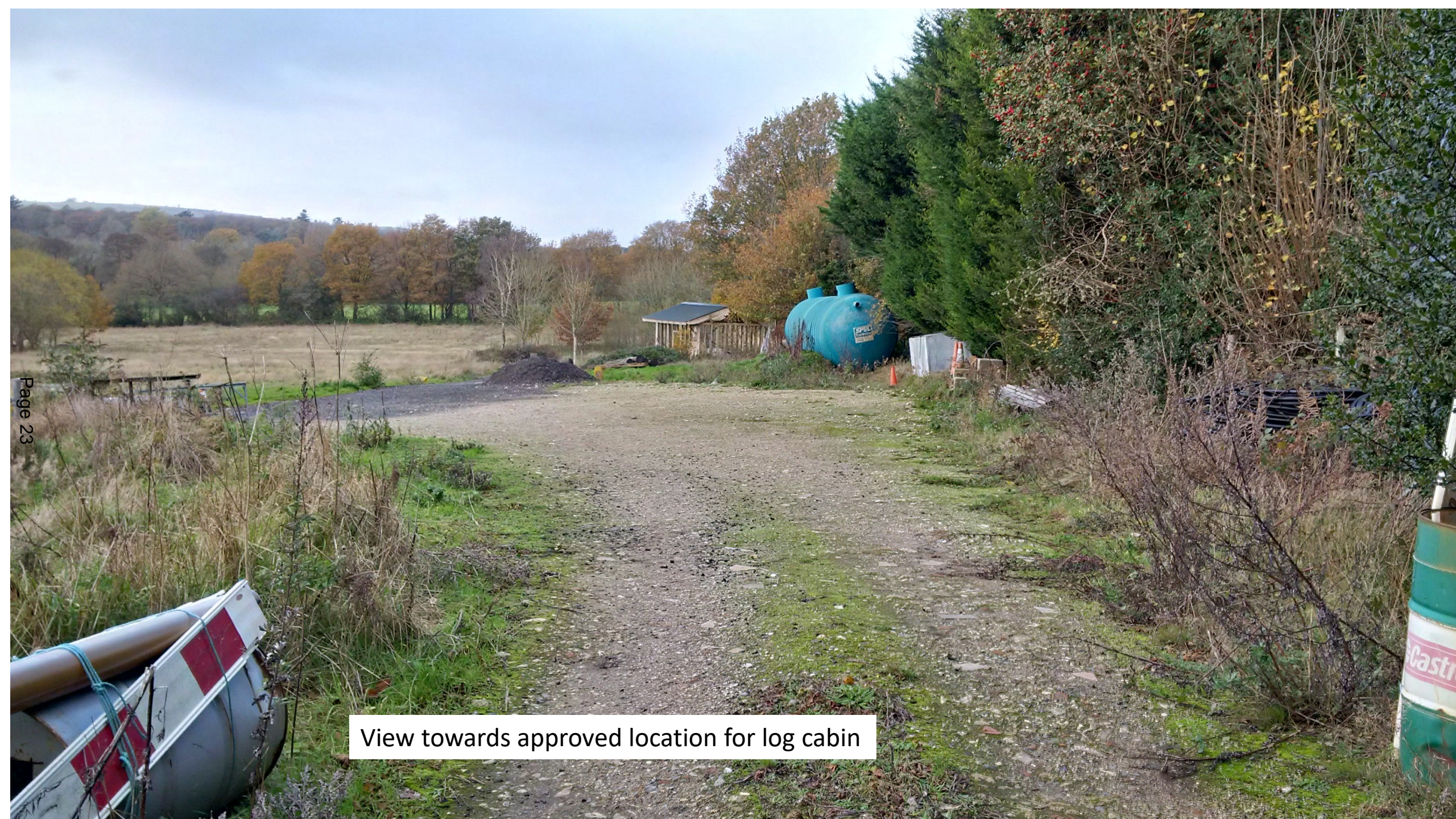
View towards approved location for log cabin