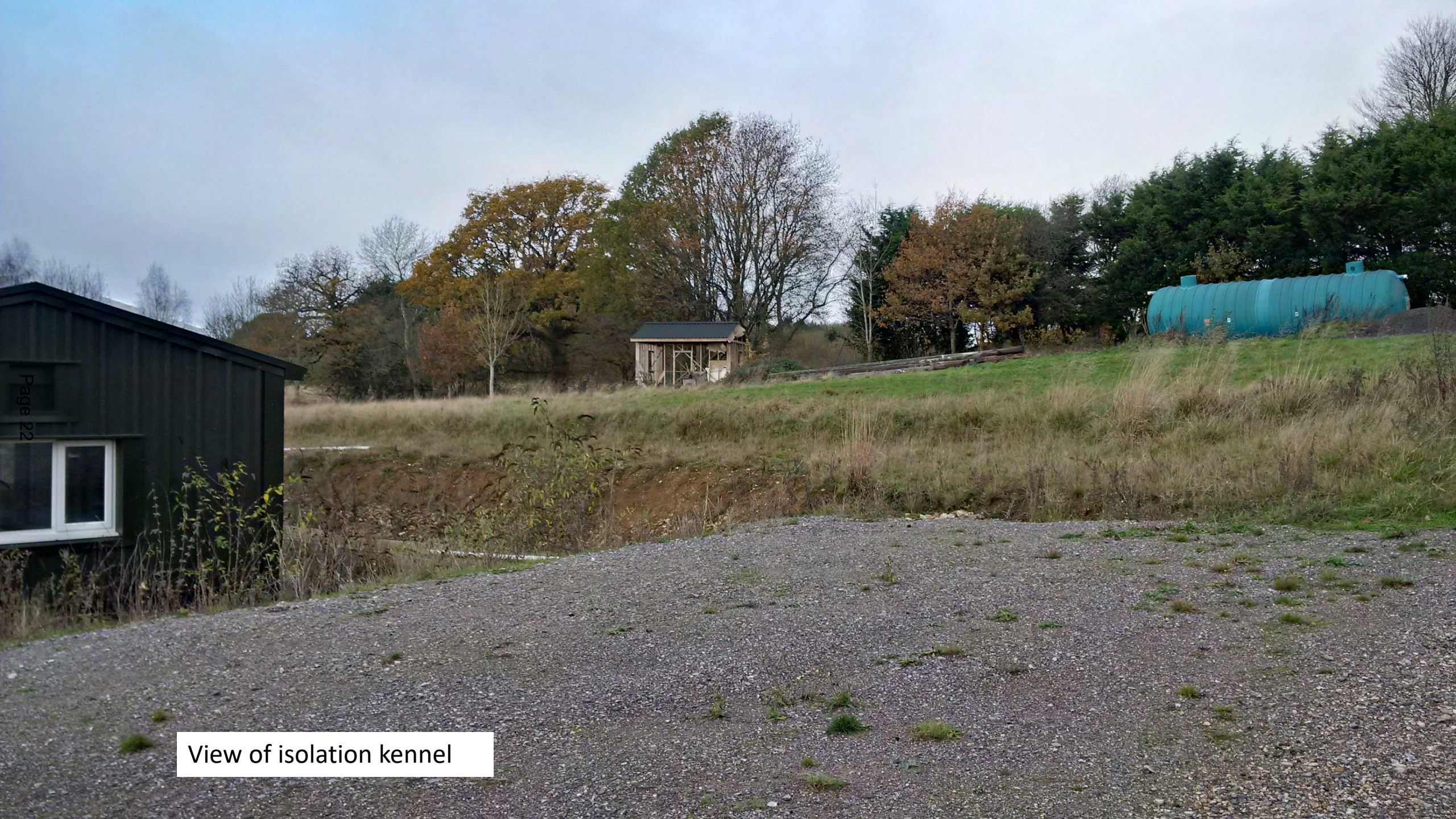
View of isolation kennel