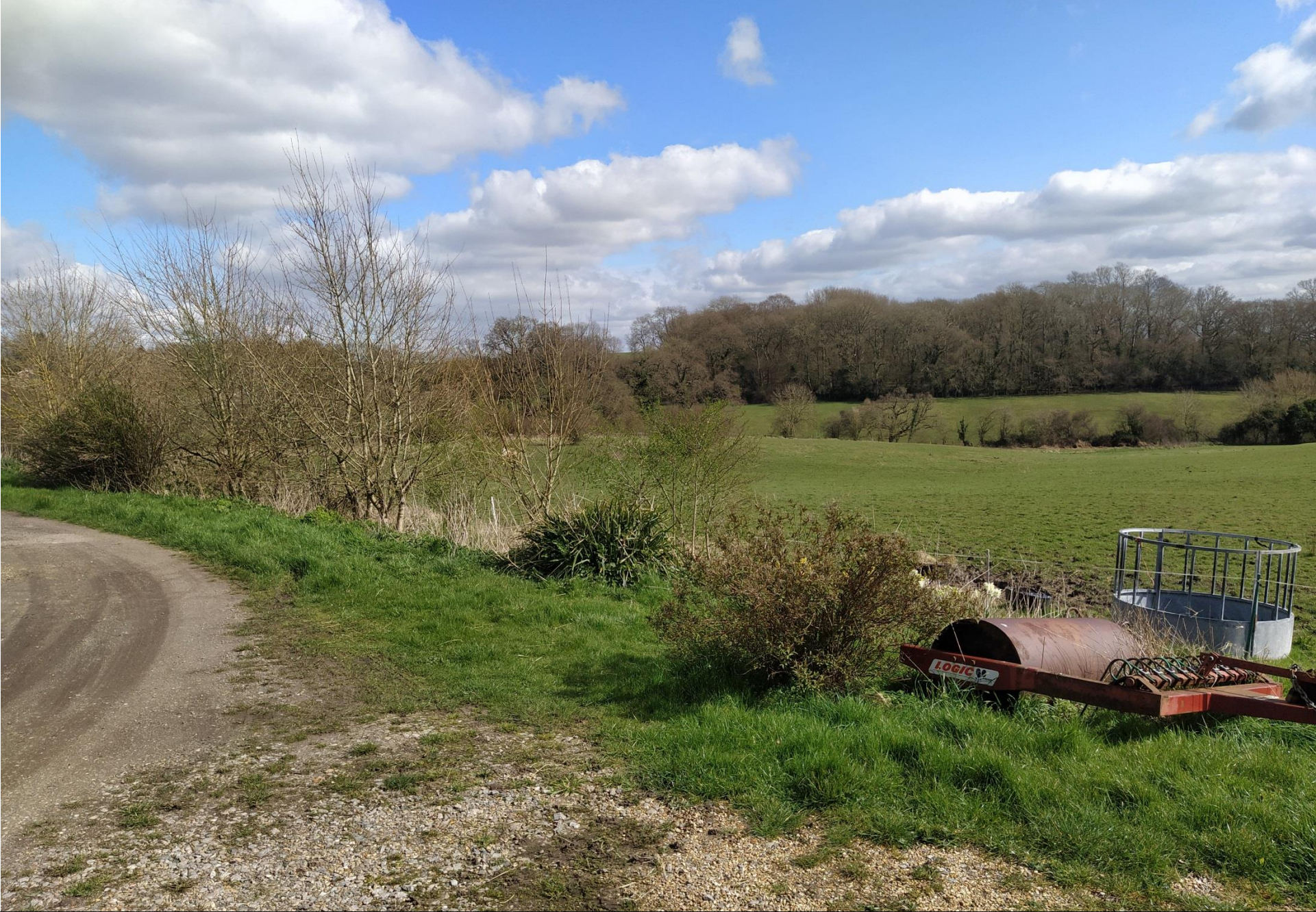
Looking north within the site