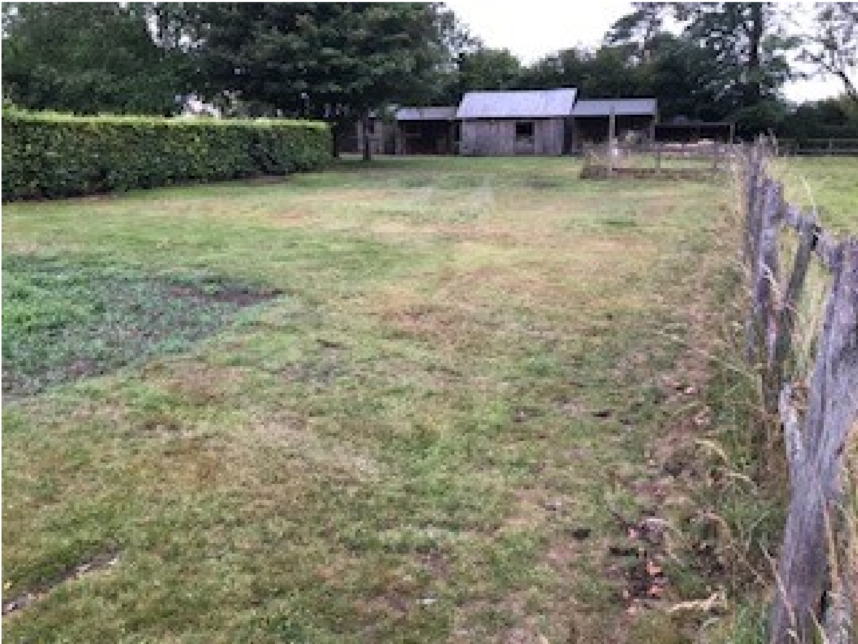
Location of stable looking towards boundary with Bee Cottage