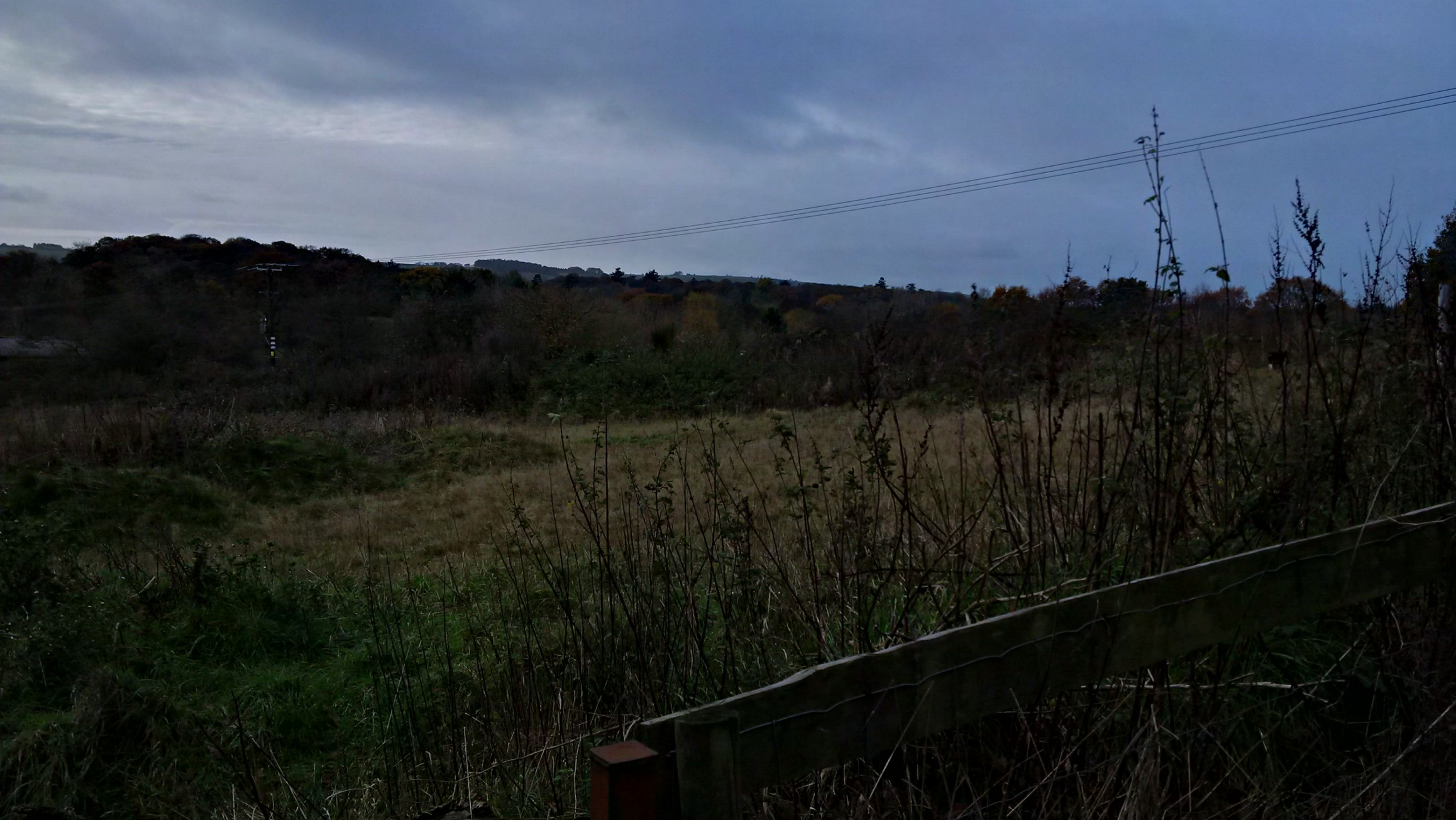
View of application site entrance off Gore End Road