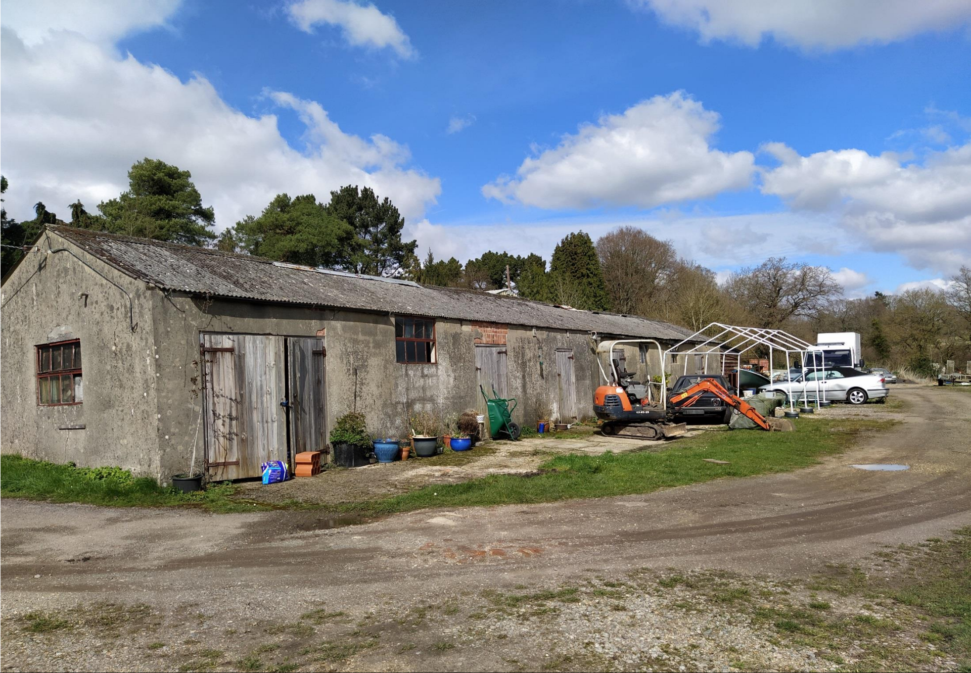
Agricultural building with the site