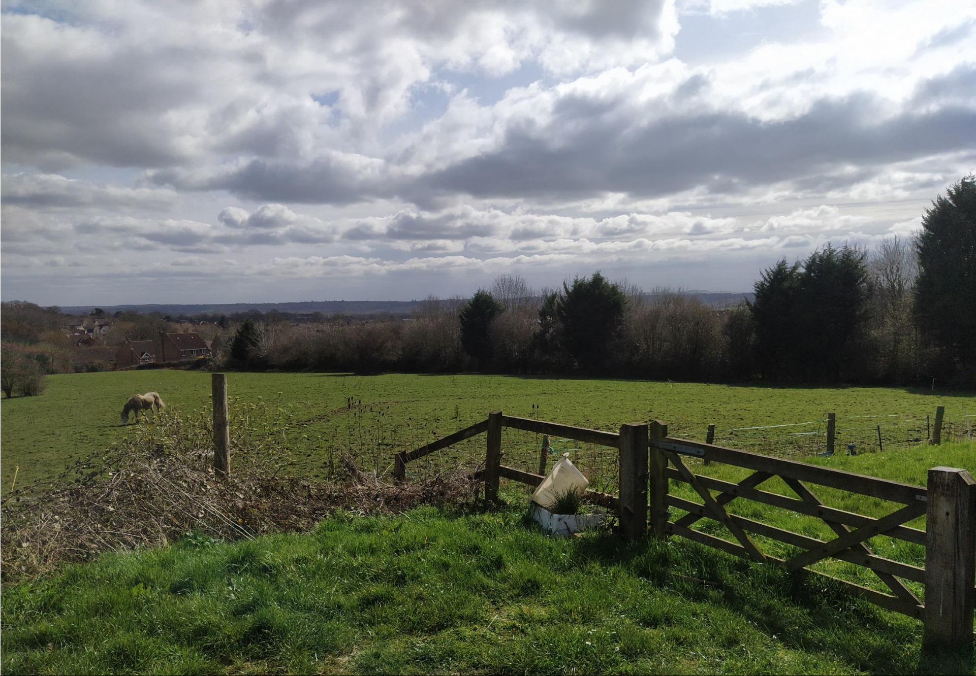
View to the south within the site